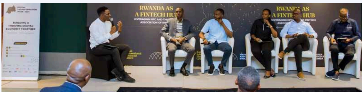
CMA participated in the monthly #FinTechFriday