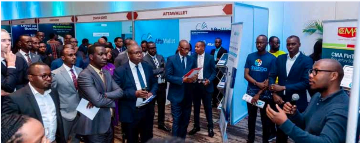
Different players in Rwanda's capital market industry attended the exhibition at the National FinTech Strategy Launch. Through CMA's FinTech Regulatory Sandbox, participants showcased their solutions which aim at building a culture of saving and investment using technology.